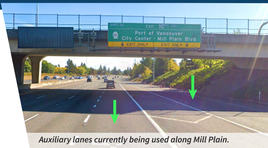
Auxiliary lanes currently being used along Mill Plain.