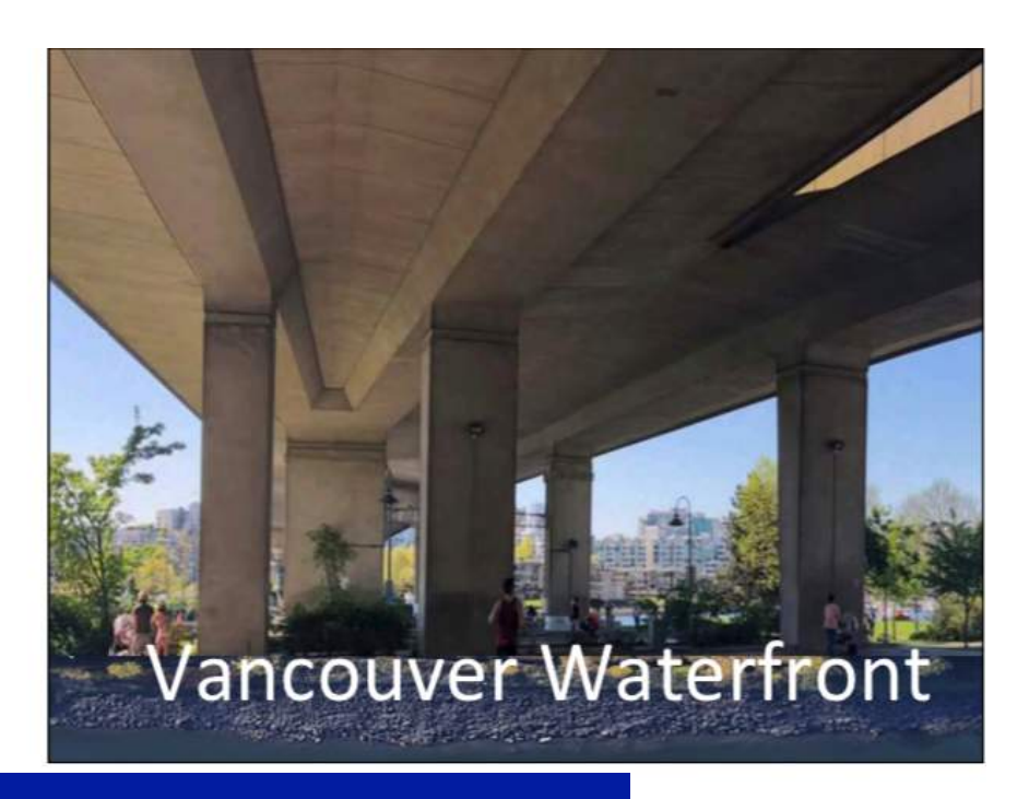
Environmental Impact of CRC Bridge design